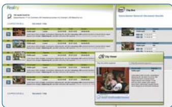
Search, select and generate EDLs

Get instant access to video while you're shooting. Reality lets you encode video and log content descriptions in real time, making them available for viewing, playing and browsing while you're still shooting. You can start building your production right away.